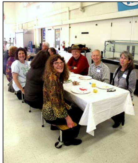
Diners enjoying their meals at the December Holiday Potluck