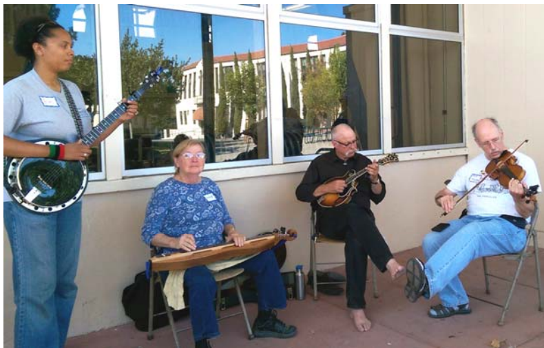
Susan Goodis photo