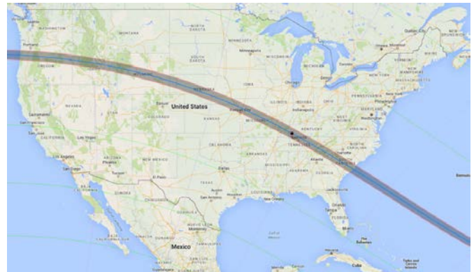
2017 total solar eclipse path

If you can't make it to the eclipse path, a banjo will do!